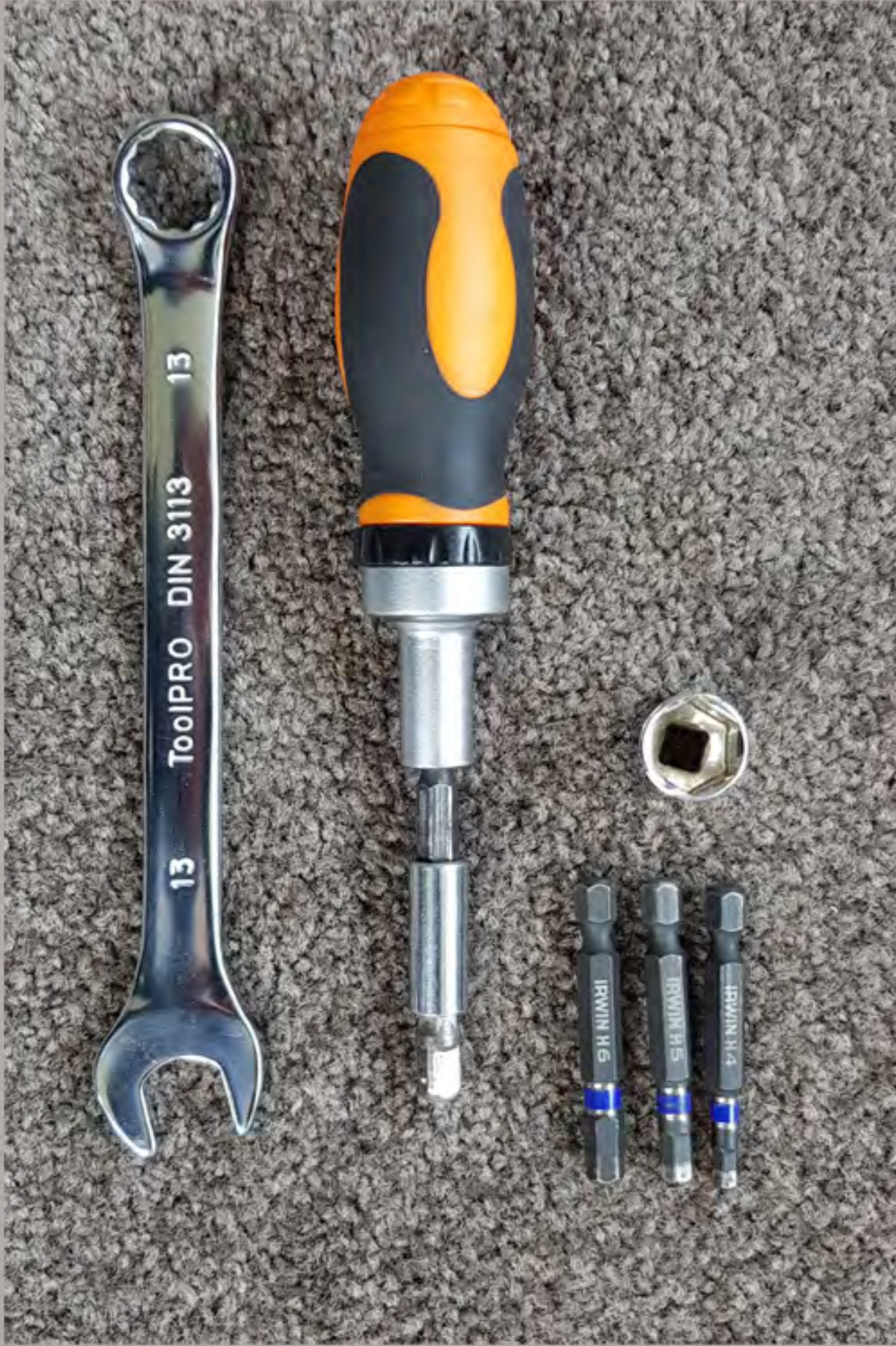
Tools (not included)