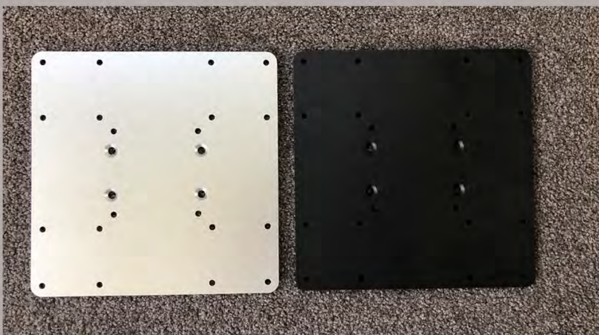
Vesa plate 200 x 200 (Optional)

Please note on pictures with assembled stands are old style Vesa mounts